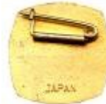
Safety Pin Back