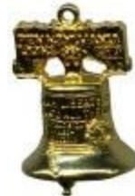
1976 Gold Medallion