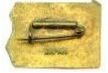
Safety Pin Back