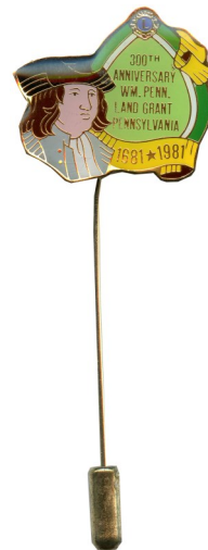
1981 Stickpin (Long Pin)