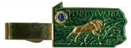
1977 Green Tie Bar