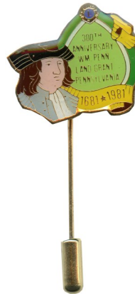
1981 Stickpin V (Short Pin)