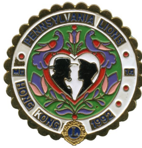
1992 P V-1