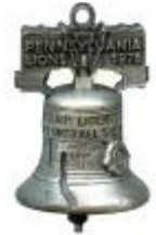
1976 Silver Medallion