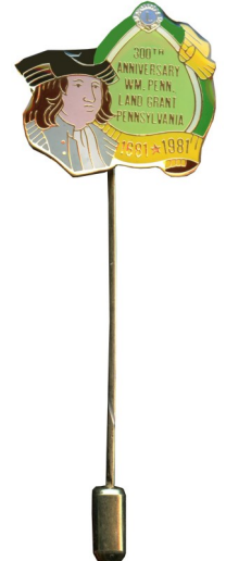
1981 Stickpin V Long Pin Yellow Curlicue at Top of Scroll