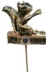
1984 Gold Stickpin