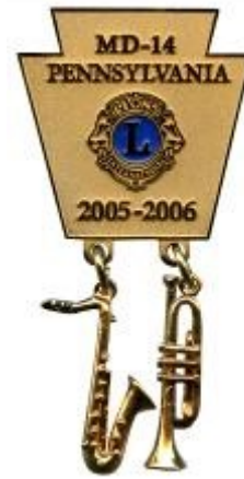
2006 V 3-D Instruments