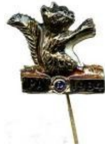
1984 Silver Stickpin